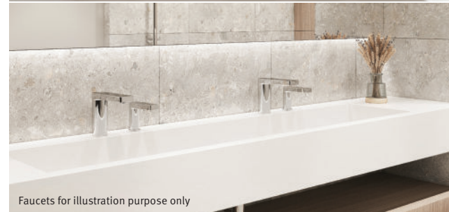
Faucets for illustration purpose only